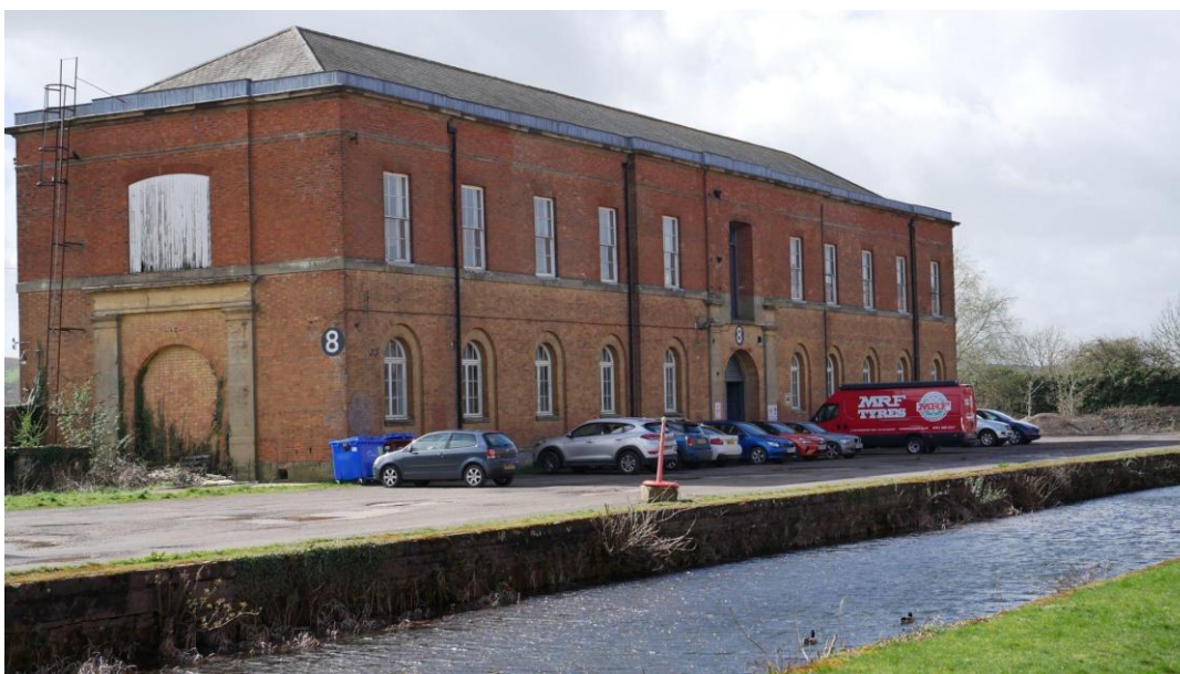
The BTS office is the lower left unit in this 18th-century former ammunition depot. Internally, it is split roughly in two with an insulated office unit and an open workshop area.

To investigate this, the BTS office was modelled in SBEM. The office is one unit of four in an 18th-century, solid-walled building. As for the RdSAP modelling in the previous section, the U-value of the main wall was adjusted in the model to match the upper and lower 95% prediction interval bounds for the wall type.