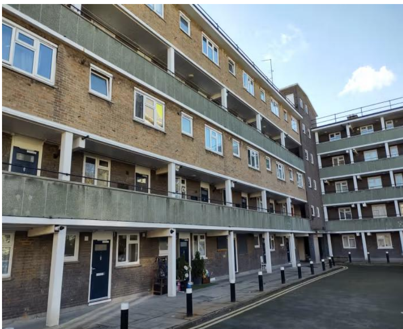
Treadgold House on the Lancaster West Estate before retrofit works

The U-value measurements on Treadgold House, showed particularly high heat loss through the floors associated with excessive thermal bridging caused by the solid concrete walkways. This insight contributed to the retrofit design in which these areas were enclosed, eliminating this thermal bridge.