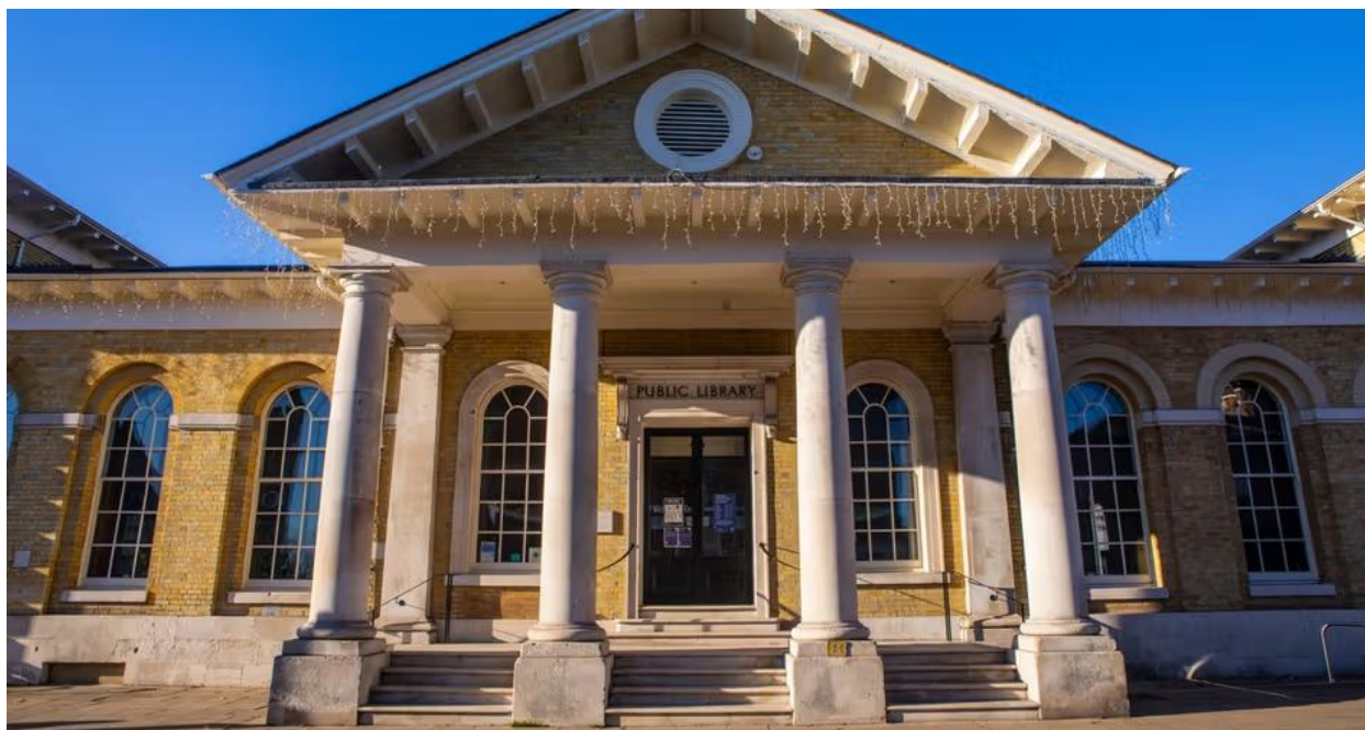
The Arc, a Grade II* listed public space in Winchester, for which U-value measurements were used to inform a retrofit plan

To understand the true building energy performance of The Arc, while keeping it open for public use, Beyond Carbon used Build Test Solutions' (BTS) Heat3D infrared U-value measurement technology to carry out unobtrusive U-value measurements across the spaces. Kate Brown, principal consultant at Beyond Carbon, said: